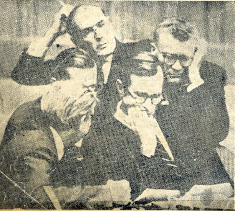
U.S. diplomats perplexed — George Bush, Ambassador to the U.N. and aides. Jerusalem Post. Perplexed over Middle East Crises.

"If I forget thee, O Jerusalem, let my right hand forget her cunning if I do not remember thee, let my tongue cleave to the roof of my mouth if I prefer not JERUSALEM above my chief joy." Psalms 137: 5-6.