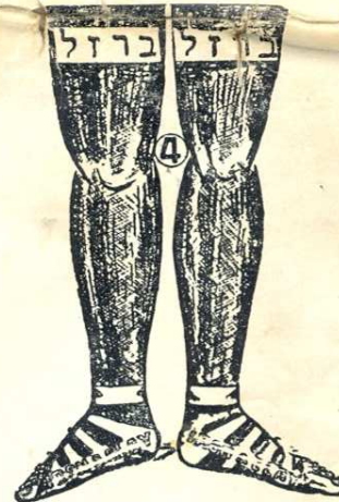
ROME, Kingdom No. 4, showing the legs of iron and feet of iron and miry clay, where we are today. Capitalism, the iron. Communism the clay. See Daniel chapter 2.

The prophet Daniel gave a clear and distinct outline of the Gentiles nations in chapter 2 of his book. The vision was given to king Nebuchadnezzar, 603 B.C. This image announcing the four periods of Gentile rule over the world have come to pass with remarkable accuracy and are recorded in every history and encyclopaedia of world events. Even the two